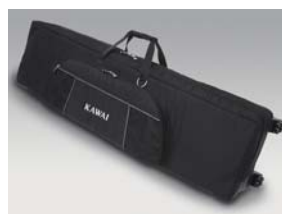
Carry Bag with castors