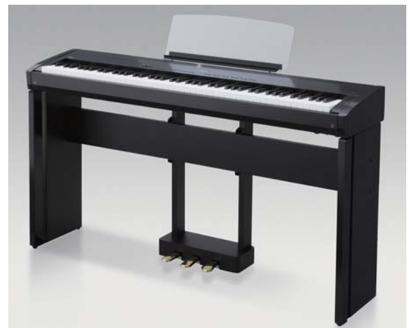
HM-3II Designer Stand with F-300H Triple Pedal (sold separately)