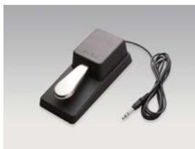
F-10H Damper Pedal