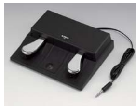
F-20 Damper/Soft Pedal