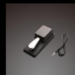
F-10H Single Pedal