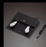
F-20 Double Pedal